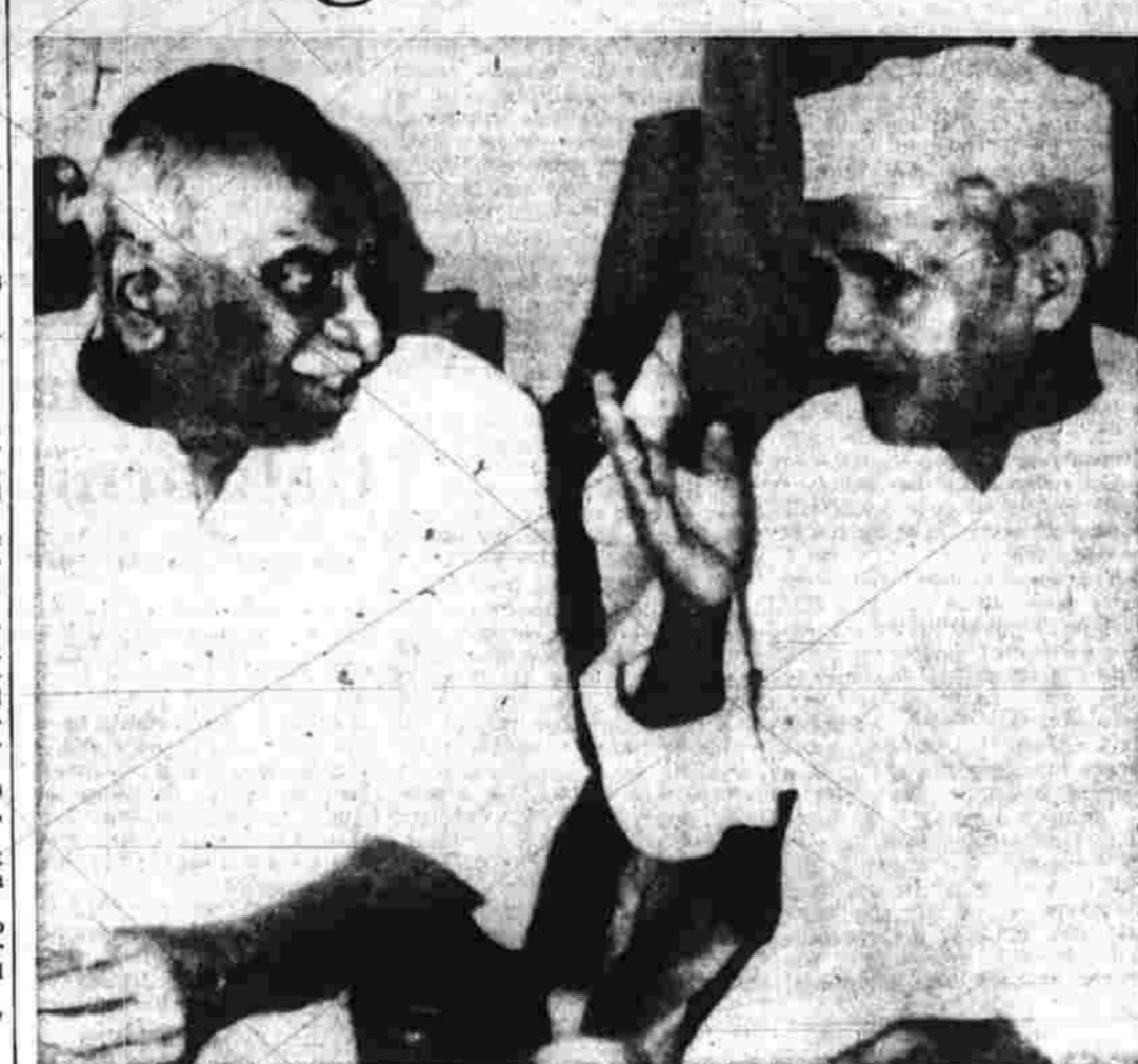
Lal Bahadur Shastri, right, talks in New Delhi today with Kumaraswami Kamaraj, president of the Congress Party...