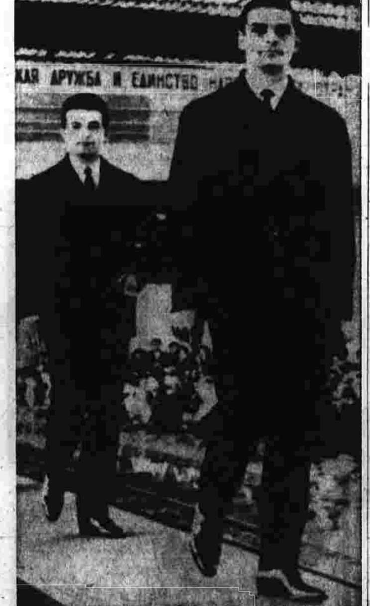
Moscow Fashions Male models—Russia and Poland, right to left—show latest men's wear at a Moscow fashion exposition today. The style show was put on by Comecon, Communist-bloc group seeking to coordinate production among Socialist states of East Europe.

NEW DELHI, India (AP) — new prime minister must face relations with Red China. Shastri said Prime Minister Srinawo Bandaranaike of Ceylon and Bertrand Russell, the British philosopher-pacifist, had made overtures for settling the border dispute with Red China but "statements emanating from Peking are not encouraging."